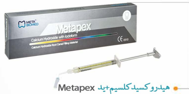
• هیدروکسید کلسیم + ید Metapex