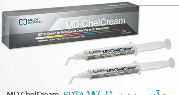
• آر سی پرپ - ژل ۱۹٪ EDTA MD.ChelCream