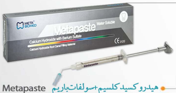
• هیدروکسید کلسیم + سولفات باریم Metapaste