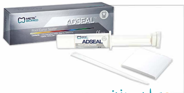
• سیلریس رزینی ADSEAL