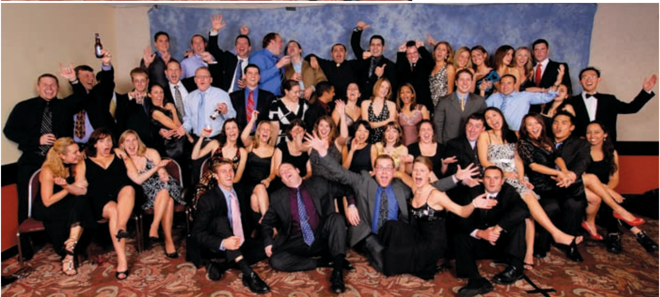
The class of 2008 practices for future reunions.