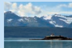
The Inside Passage

UB School of Dental Medicine University at Buffalo The State University of New York