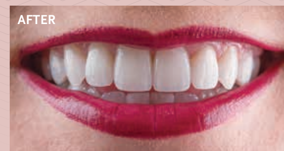
(Above) Postoperative View, Closeup