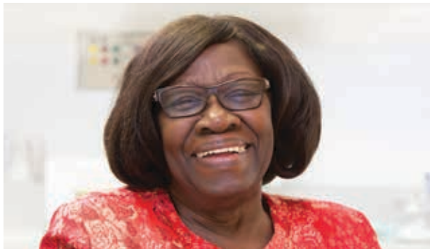
(Above) A patient wearing an Ultaire™ AKP RPD.

Ph.D. scientists focused on our specialty polymers group, we developed a product to serve a huge patient population that deserved something better.