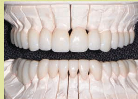
Figure 8: Zenostar Monolithic Restorations on Model