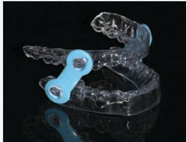
(Above) The EMA is an oral appliance for noninvasive treatment of snoring and OSA.

For severe cases, physicians may recommend surgery to remove soft tissues in the back of the throat to keep the airway open. But some statistics show that this surgery may only last