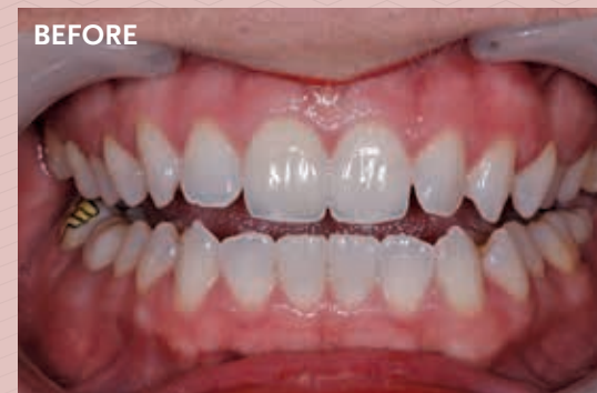
(Above) Preoperative Retracted View. Chelsea has a Wonder Woman tattoo on a posterior tooth.