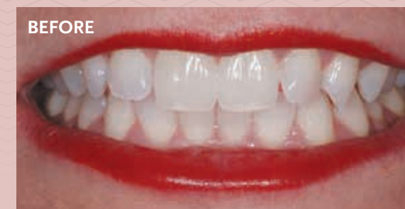
(Above) Preoperative View, Closeup