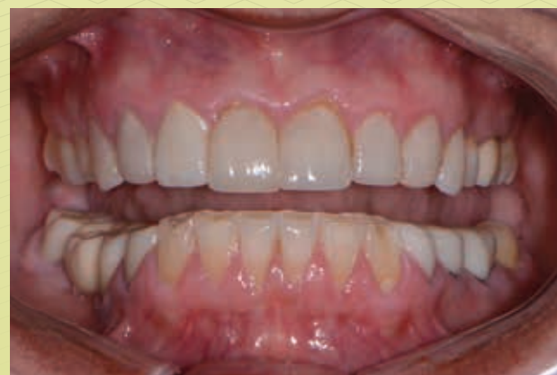
Figure 1: Preoperative Retracted View

In the maxillary arch, the patient had several teeth with worn composite and veneer restorations, as well as abfractions with cervical decay (see Figure 2, on page 19 ). In the lower arch, several existing composite restorations had worn, and decay