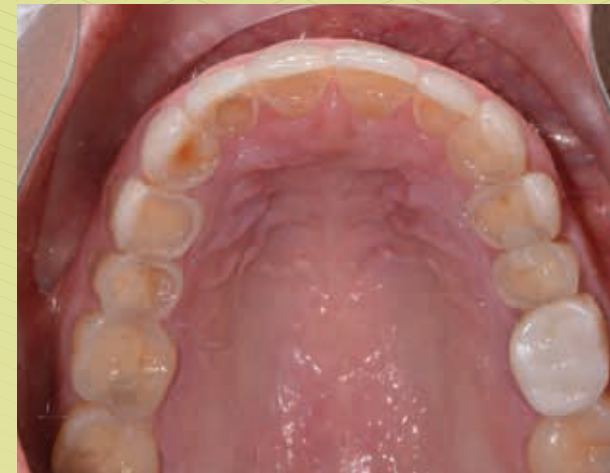
Figure 2: Preoperative Maxillary Occlusal View