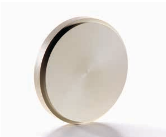
(Above) An unground Dentivera milling disc.

Solvay: Ultaire™ AKP is not made from metal, but rather a high-performance polymer similar to those used in spine and hip implants. This biocompatible material is monomer free, and has a reduced occurrence of sensitivity issues, making Ultaire™ AKP an excellent choice for patients with metal sensitivities.