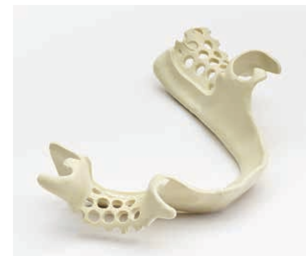
(Above) Ultaire™ AKP frame without teeth.

Until recently, removable partial dentures were some of the only restorations in the dentistry industry that were still overwhelmingly fabricated using metal. Solvay saw a need in this market and was uniquely qualified to fill it. With numerous ▶