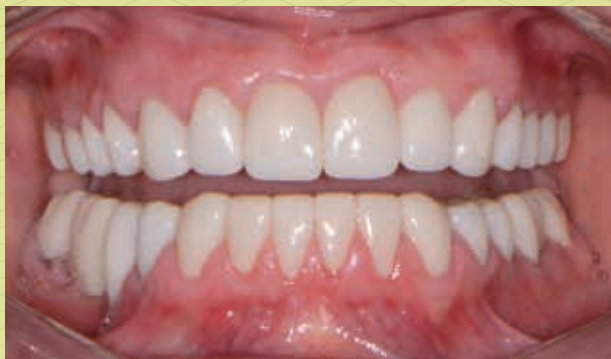
Figure 10: Postoperative Retracted View