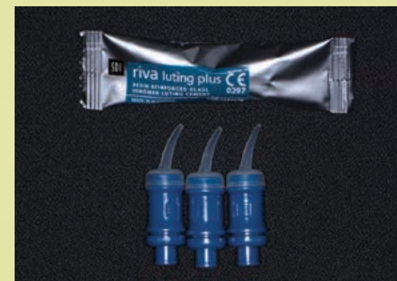
Figure 9: Resin Modified Glass Ionomer Cement

With Riva Luting Plus, it's easy to remove excess cement, it releases fluoride, and it has low solubility in an oral environment. Excess cement was removed and cleaned up in about two minutes at the gel phase. After the cement was fully set (at five minutes), the occlusion was verified and adjusted. ►