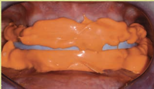
Figure 5: Bite Jig Relined Capturing Full Arch Bite