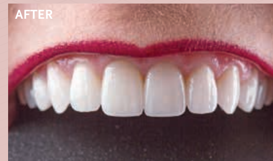
(Above) Postoperative View

We decided to make tooth numbers 2 and 15 in gold because of my clenching and my bruxism, and to hold my bite stops. The remaining Elite restorations were made from IPS e.max. After the crown slipped, Dr. Pauly had to find a way to ensure that the rest of the restorations were seating correctly.