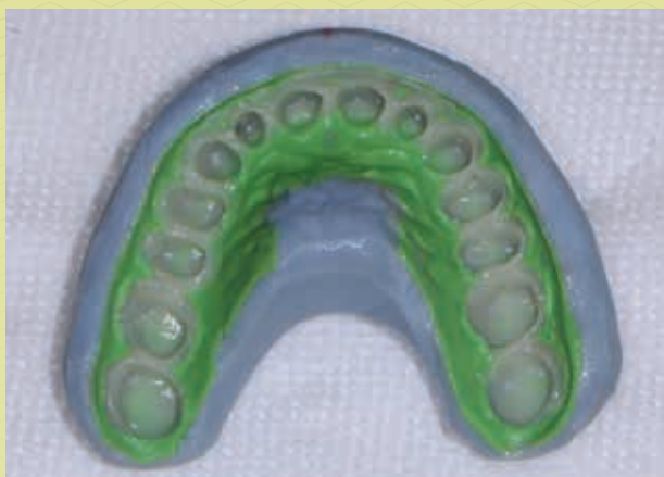
Figure 6: Fabricating Provisional Restoration