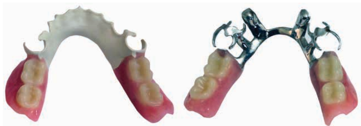
(Above) Ultaire™ AKP RPD (left) and metal frame RPD (right).

LC: For several years Arrowhead Dental Lab has offered two types of removable partial dentures—cast metal, and acrylic. Recently, Arrowhead has started offering the Ultaire™ AKP