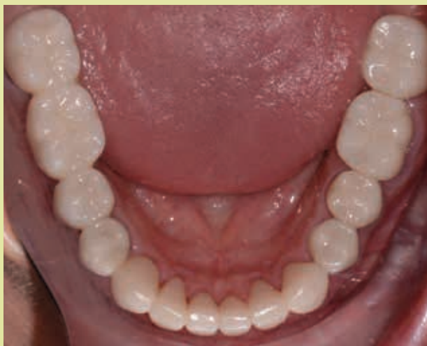
Figure 12: Postoperative Mandibular Occlusal View

The overall health and structure of the soft tissue and restorations was very good. The patient was extremely satisfied with the definitive results.