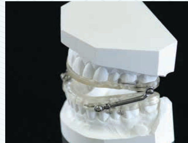
(Above) The Herbst is an adjustable orthodontic appliance for the aid of snoring and mild to moderate OSA.

Medicare's policy is that only a dentist can offer oral appliances, and in many cases Medicare sets the standard that many private insurance companies follow. However, not all private insurance companies follow the same guidelines. I advise dentists to use a manufacturer that is making FDA-cleared oral devices,