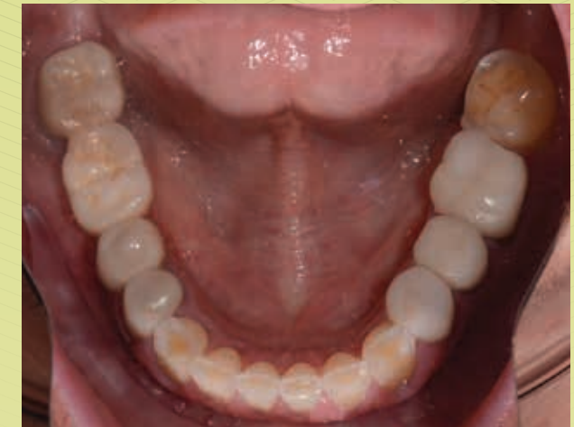
Figure 3: Preoperative Mandibular View

was exhibited on the facial cervical areas. Although there were no restorations present in the anterior mandibular teeth, there was severe wear in the incisal edges due to possible grinding and parafunction (see Figure 3, above right ).