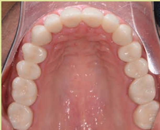
Figure 11: Postoperative Maxillary Occlusal View