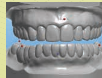
Figure 4: Digital View of Wax-Up

Due to their warm, reddish nuance, Zenostar® Zr Translucent sun and sun chroma are suitable for restorations with individual color characterization, and can therefore be used for patients whose own natural dentition deviates from the classic tooth shades. >