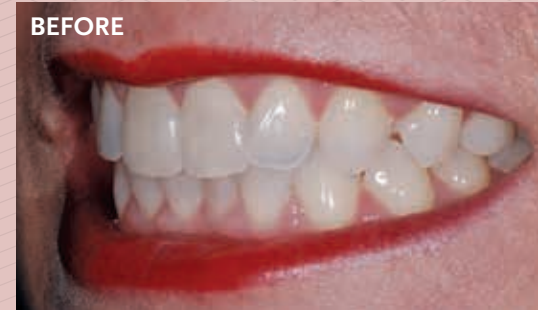
(Above) Preoperative View, Biting