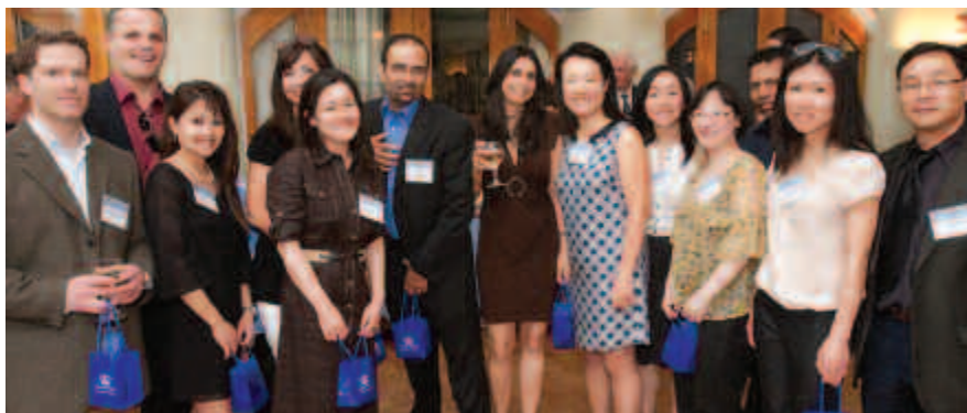
bottom, right: Class of 1989.