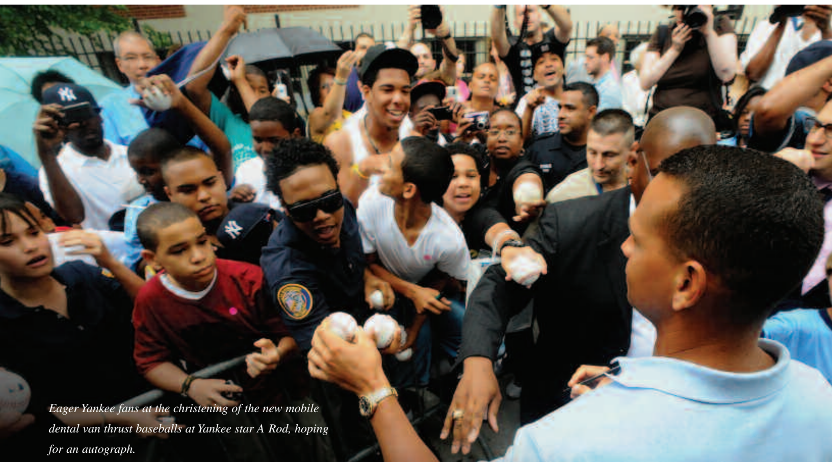
Eager Yankee fans at the christening of the new mobile dental van thrust baseballs at Yankee star A Rod, hoping for an autograph.

The van, he said, would reach children at Head Start, public schools, and daycare centers located throughout Washington Heights/Inwood, Harlem, and the Bronx, offering oral health education, preventive care, and comprehensive care.