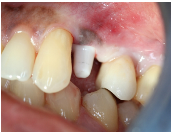
Figure 2. Corrosion in relation to upper first premolar.

cussed in orthopedic literature, may jeopardize the mechanical stability of the implant and the integrity of the surrounding tissue [28]. Implant failure in the form of aseptic loosening, or osteolysis, may result from metal release in the form of wear debris or electrochemical products generated during corrosion events. Metal ions such as Ti^{4+} , Co^{2+} , and Al^{3+} have been shown to decrease DNA synthesis, mitochondrial dehydrogenase activity, mineralization, and mRNA expression of alkaline phosphatase.